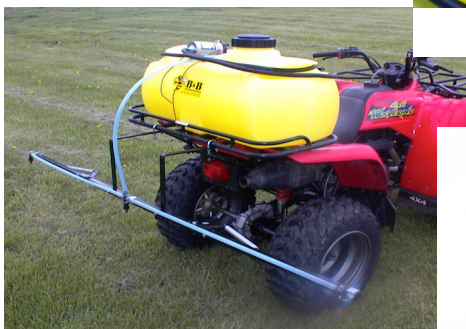
BOOM MOUNT ATV