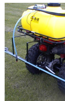
BOOM MOUNT ATV